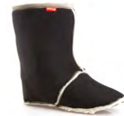
Use with ID504 Liner Page 81